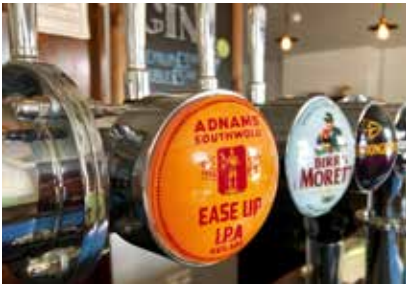
BAR OPEN Monday to Friday from 3.00 pm Saturday and Sunday from 11.00 am

FOOD SERVEI Monday to Fr 4.00 pm to 9.0 All day on Sat Sunday 12.00 to 5.00 pm