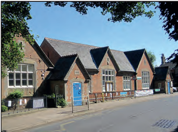
The school, built in 1873, with very unusual boys' and girls' entrances.