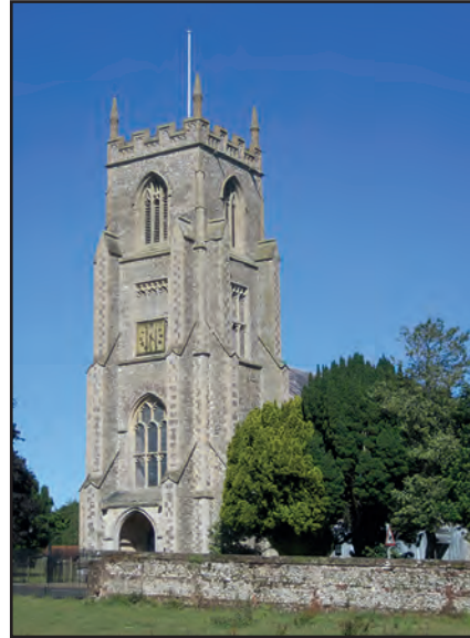
St Mary's Church built primarily between the eleventh and fifteenth centuries.