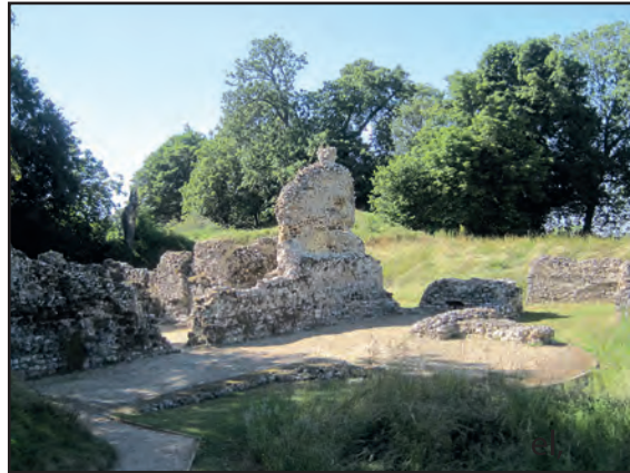
Eleventh-century ruins of a bishop's chap converted into a fortified manor house in 1387, on the site of the Anglo-Saxon cathedral.