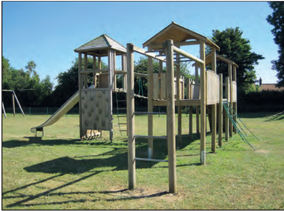
Children's play equipment on the Green, leased from the County Council in 1999 and later purchased.