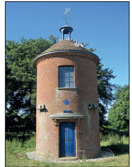
A dovecote in the park dating from 1840.